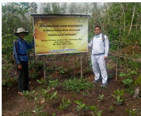
a. biodiversity development land program

Figure 2 showed the active role of beekeepers in land enrichment efforts. Subanjeriji production forest area used unproductive land as " Biodiversity Development Land ", or an enrichment garden specifically planted with honey bee woof sources from forestry plants, multipurpose plant and other flowering plants. The placement of the stup in the honey bee cultivation location followed the planting pattern of acacia plants. Of the various types of plants known to be a source of food for bees is acacia. Acacia is believed to be a plant frequented by bees and was able to provide nectar throughout the year, so that the presence of acacia in Subanjeriji production forests greatly affects the amount of honey production. Acacia plants can emit nectar drops near the stalks of the leaf base and almost all acacia leaf bases emit nectar throughout the year so that it can be a very potential and sustainable source of nectar for bees [9]. The nectar from acacia plants is a potential nectar as a source of feed for honey bees. Furthermore, it was reported that honey production from several species of acacia plants as shown at Table 4 [10]: