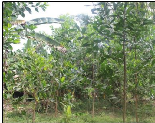
b. plant enrichment for woof source of honey bee