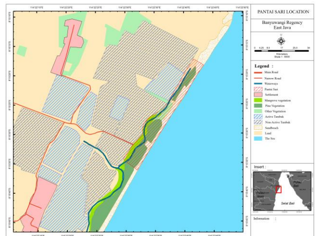
Figure 2. Map of study area

The map of study area can be seen in Figure 2. Sampling was carried out in river areas and coastal areas.