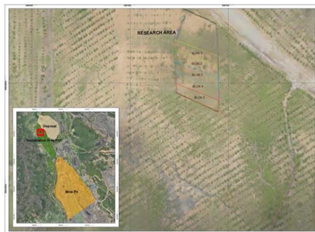
Figure 1. Location of study

The study was carried out on lahan reklamasi pasca tambang di Sumatera Selatan (Figure 1-2). The sampling location is in the finalized reclaimed area in Pit 3 Barat IUP Banko Barat Barat PT. Bukit Asam, Tbk, Tanjung Enim, Sumatera Selatan, Indonesia, with a research site area of \pm 630 \text{ m}^2 . Open-pit mining is used by the coal mining company PT. Bukit Asam, Tbk to produce coal. The initial mining procedure entails removing the soil from the overburden and clearing the concession land that will be mined. The soil is layered individually to protect its quality. After it has been reshaped to restore and improve the former mining land for its environmental function, the exposed land can also be dispersed directly in the mine reclamation area.