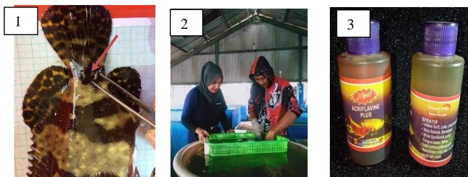
Figure 2. Types of parasites that attack potential duck grouper fish ( Zeylanicobdella arugamensis ) (1), Prevention disease by immersion in fresh water (2), Chemicals (acriflavine) ((3)

dissolved in 10 liters of water, stirred until smooth and poured on pool evenly and left for 30 minutes so that acriflavine can be effective in killing parasites that stick to the body of prospective duck grouper broodstock. Figure 2. Types of parasites that attack potential broodstock of duck grouper and how to prevent disease