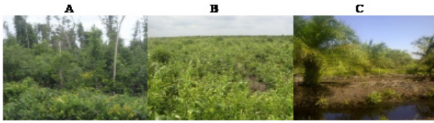
Figure 1. Study site: A (secondary forest); B (Shurbs); C (oil palm plantation)